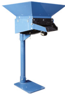
Various Live Hopper