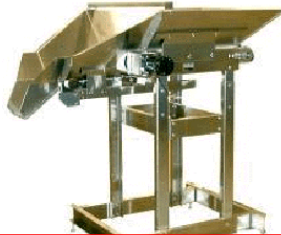
Sanitary-Bulk Supply Belt Hopper