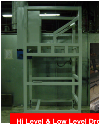
Hi Level & Low Level Drop Bottom Stands