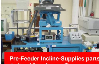
Pre-Feeder Incline-Supplies parts to bowl "on demand".